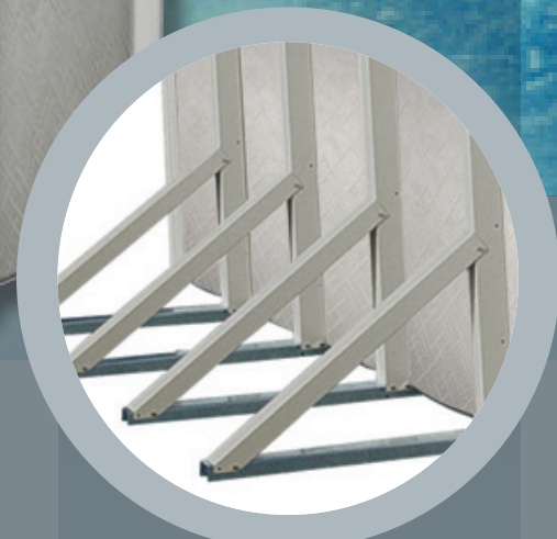
Buttress Support System on Ovals